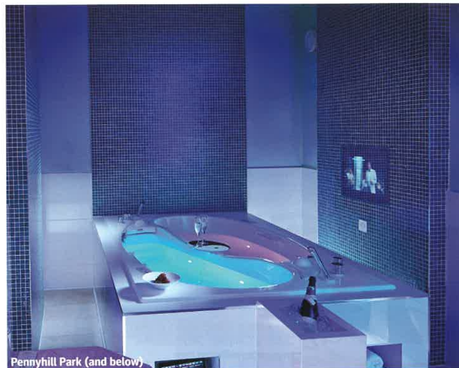
Pennyhill Park (and below)

The cutting-edge, high-tech modernity of the 40-bedroom Eccleston Square Hotel does not stop at the bathrooms. As well as the luxury facilities – rainfall showers, heated flooring and Italian marbling – the real stand-out features are the bathroom walls and mirror-mounted television. Every bathroom wall and door is made of SmartGlass, which switches