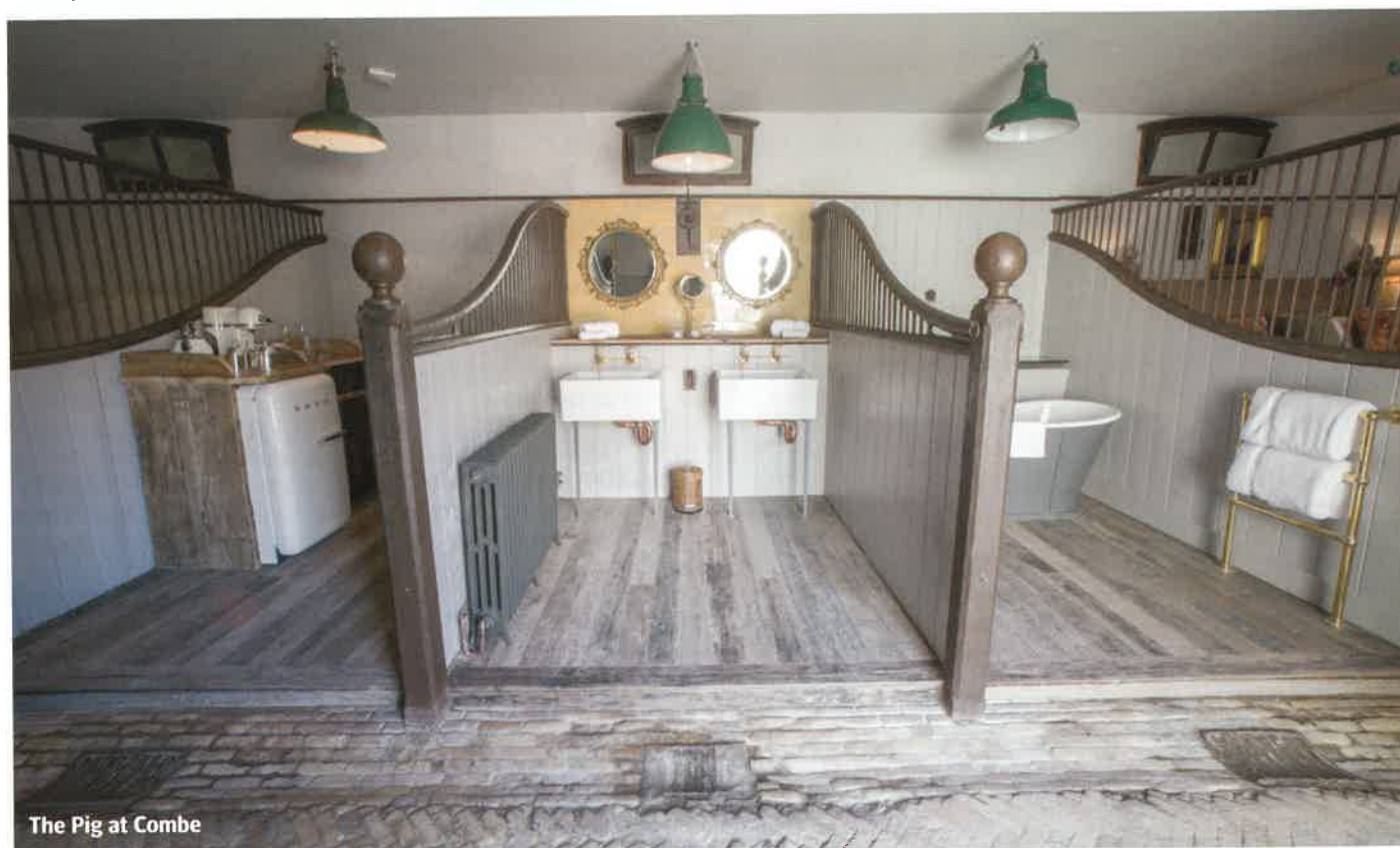
The Pig at Combe

The Horsebox at the newly opened 27-bedroom Pig at Combe hotel near Honiton, Devon, is a prime example of making the most of a quirky space and retaining original features in a fun, stylish way. However, it is also an example of how to transform a room within the strict limitations of a Grade I-listed structure. Located on the ground floor of the stable yard and featuring the original stable partitions and paved flooring, the space also has a freestanding bath, walk-in monsoon shower and reinstated sinking troughs. The bathroom plumbing had